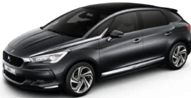
HURRICANE GREY (F)