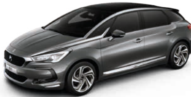
PLATINUM GREY (M)