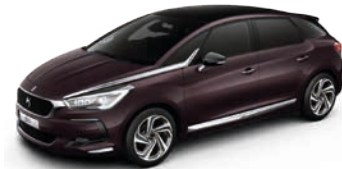
WHISPER PURPLE (M)