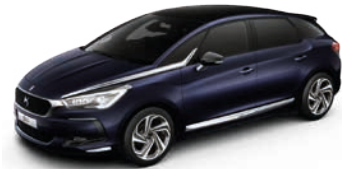
INK BLUE (M)