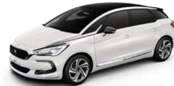
PEARL WHITE (P)