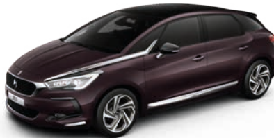
WHISPER PURPLE (M)