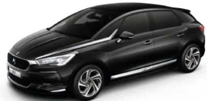
PERLA NERA BLACK (M)