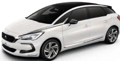
PEARL WHITE (P)