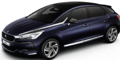
INK BLUE (M)