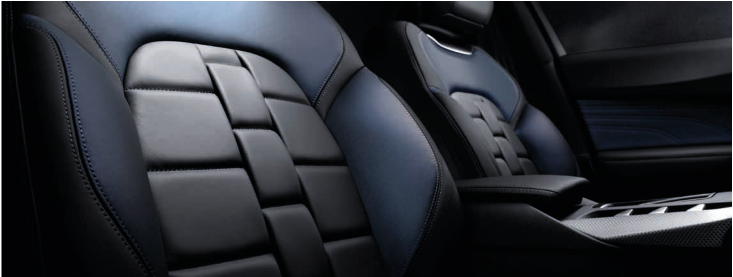
BASALT BLACK AND SAPPHIRE BLUE NAPPA WATCHSTRAP LEATHER