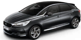
HURRICANE GREY (F)